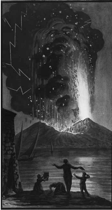
Figure 2: The eruption of Mount Vesuvius in the night of 8 August 1779, coloured etching by Pietro Fabris, 1779.

Hamilton sought also to dispel the mysticism surrounding volcanoes for the general readership. Illustrations were one means of achieving this but Hamilton levelled scepticism upon the religiosity around volcanic entities. Whereas Kircher had still viewed volcanism as an inherent part of a divinely preordained plan, Hamilton objected in muted tones. 64 His reports included stories of the terrified reactions by local inhabitants to Vesuvian eruptions. Such narratives revolved around the local faithful praying for the intercession of St. Januarius (San Gennaro) and the parading of his relics and ikons in times of peril as if to ward off the incoming devastation. Such narratives underscored the prevailing stereotype of superstitious Neapolitans placing their faith before reason or as Hamilton put it more bluntly, the “usual misture [sic] of riot and bigotry.” 65 Hamilton and Fabris encoded the futility of such actions in one